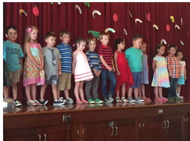
This group from the 4 year-old Preschool class says good-bye as they