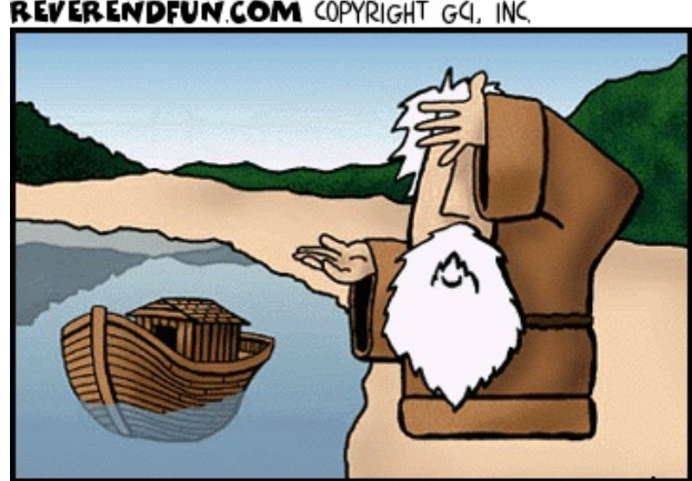
(See Genesis 6-8) 10-06-1998

If you cannot serve, please find your own replacement and notify the office of the change.